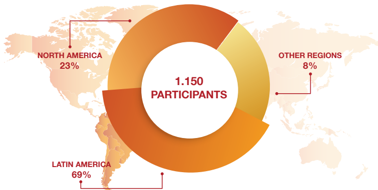
CAEI COLOMBIA 2019