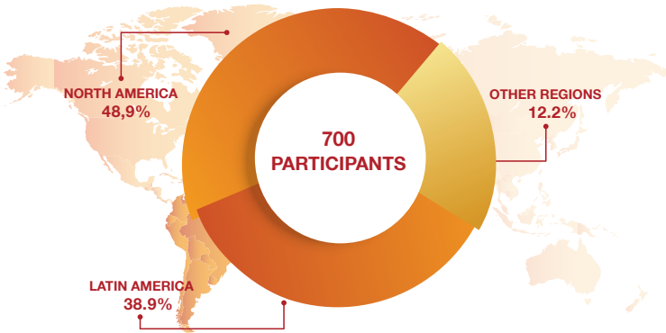
CAEI CHILE 2021